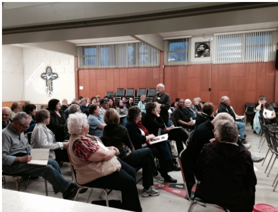
Just in Case Workshop – Davidson