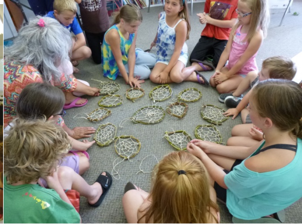
The Dream Catchers are ready to work.