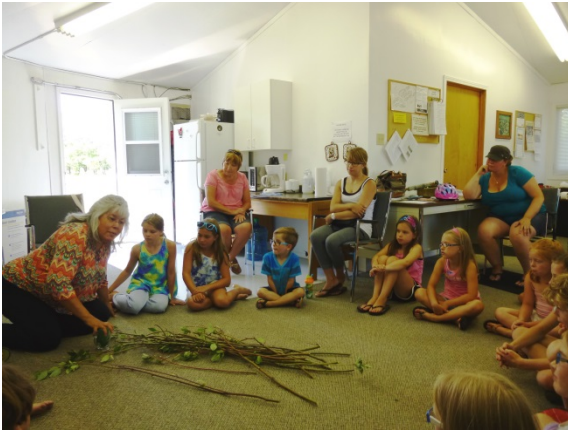
Dream Catchers – our tools