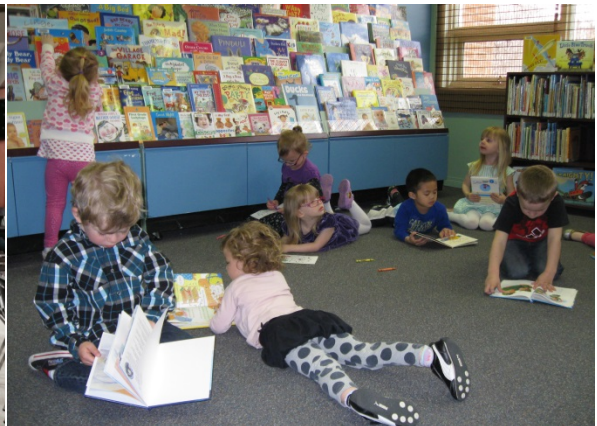
Play School Visits