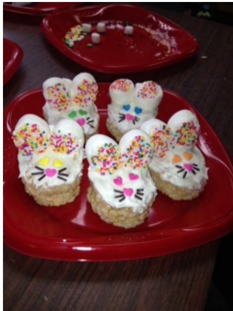
Delicious Easter Bunny Crafts in Loreburn