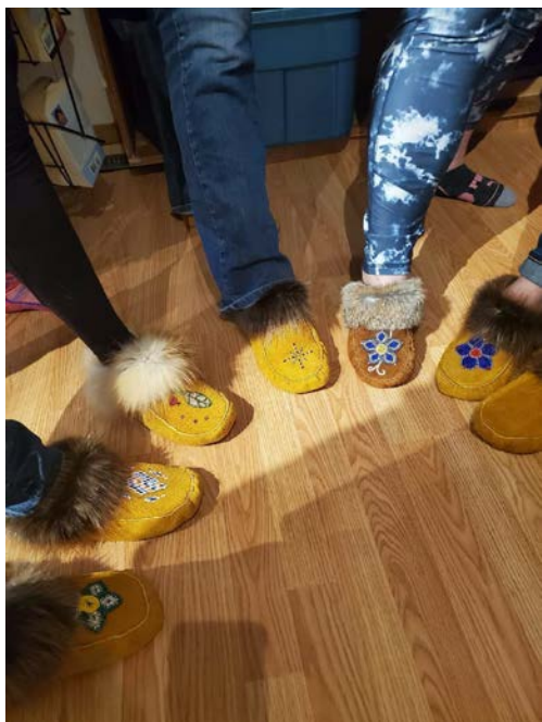
The crafty people at Tugaske show off their hand-made beaded moccasins.