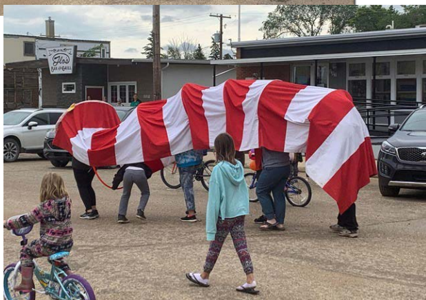
The Palliser bookworm made an appearance at the Craik parade.