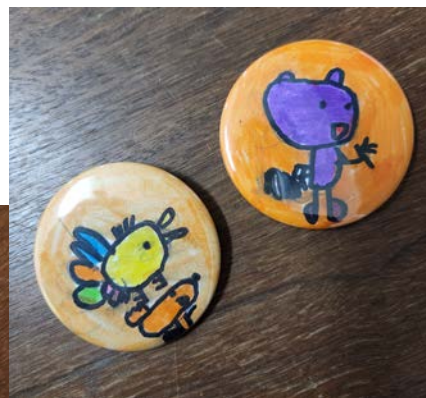
Ruth Ohi's visit inspired button creations in Loreburn